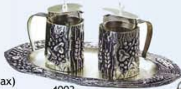
4003 Silver Plated

9000/3000 Lectionary & Gospel Book Covers Ht 36cm, W 23cm, D 5cm (max) Brass, Silver or Gold Plated or 2 Tone