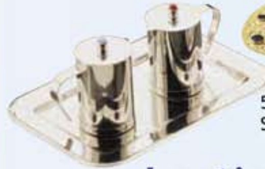
5501 Stainless Steel